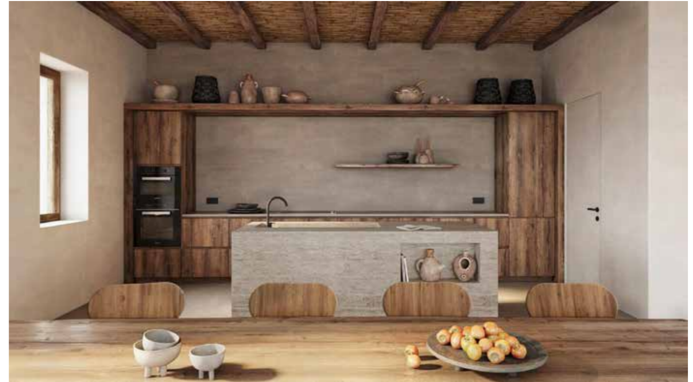
ABOVE Bedroom & kitchen area.