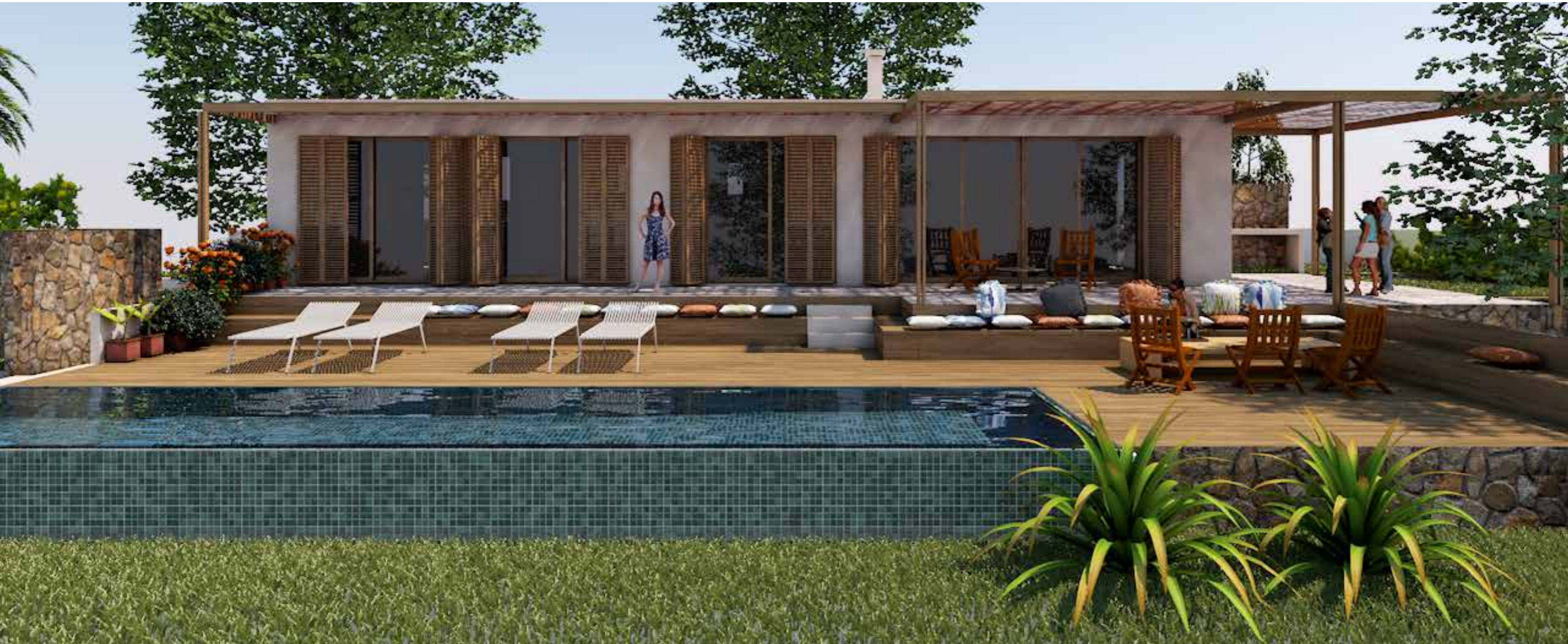
ABOVE Poolside in the rear gardens.