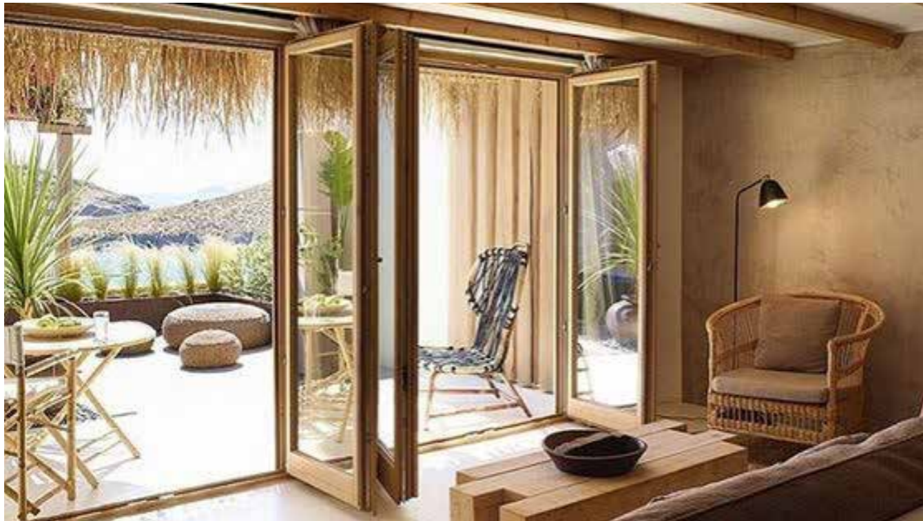
ABOVE Living room.