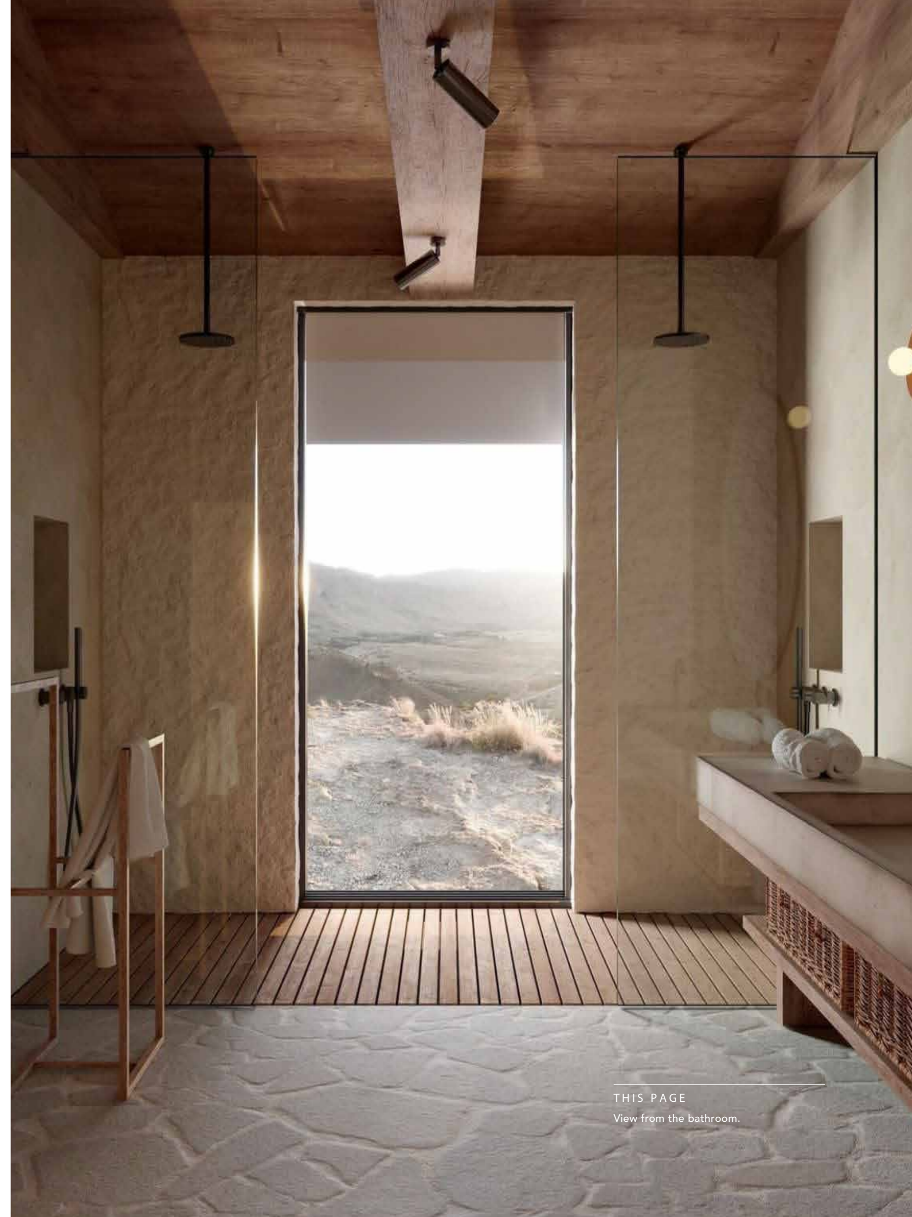
THIS PAGE View from the bathroom.